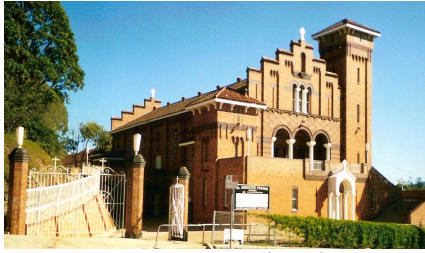
St Ignatius Church Kensington Terrace, Toowong