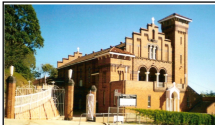
St Ignatius Church Kensington Terrace, Toowong