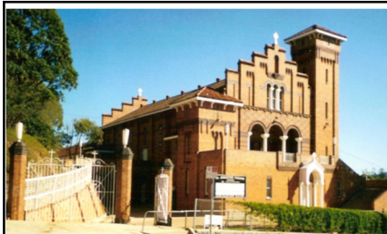
St Ignatius Church Kensington Terrace, Toowong