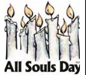
All Souls Day

ALL SOULS' DAY: Thursday 2 November: (Please note change to the usual weekday Mass times on this date) 9am Holy Spirit Church and 5.30pm St Ignatius Church.