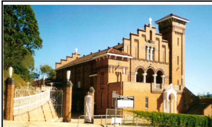
St Ignatius Church Kensington Terrace, Toowong