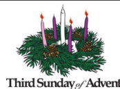
Third Sunday of Advent