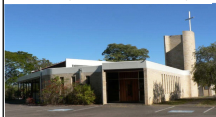
Holy Spirit Church Harriett Street Auchenflower